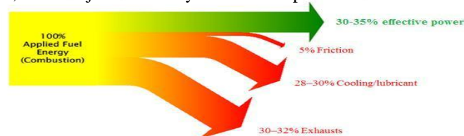
Fig 1: Error! No text of specified style in document. sankey diagram of diesel engines

A diesel engine is an internal combustion engine which operates using the diesel cycle. Diesel engines have the highest thermal efficiency of any internal or external combustion engine, because of their compression ratio. The diesel internal combustion engine differs from the gasoline powered Otto cycle by using a higher compression of the air to ignite the fuel rather than using a spark plug for this reason it is known as compression ignition and the petrol engine is referred as spark ignition engine. In the diesel engine, only air is introduced into the combustion chamber. The air is then compressed with a compression ratio typically between 15 and 22 resulting into a 40 bar pressure compared to 14 bar in the gasoline engine. This high compression heats the air to 550 °C. At about this moment , fuel is injected directly into the compressed air in the combustion chamber.